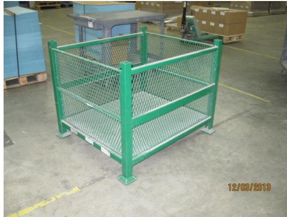
HEAVY-DUTY EXPANDED METAL BASKETS 34.5" X 40.5" X 33" HIGH EXPANDED METAL SIDES & SOLID FLOOR 2 DROP GATES $ 139.00 EA / 20 AVAILABLE