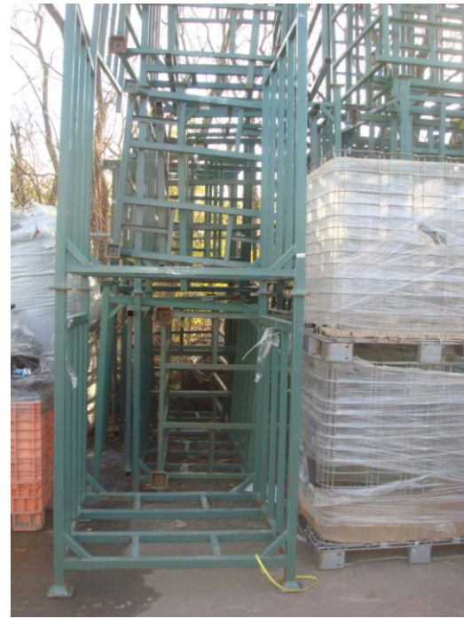
H.D. STACKING RACKS 48" X 48" X 54" HIGH RIGID POSTS WELDED 2 BRACED SIDES $ 139.00 EA / 11 AVAILABLE