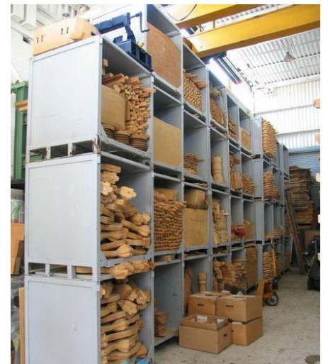
STACKING STEEL BINS WITH LIDS 35.25" X 33" X 39" HIGH COME WITH LID THAT OPENS REMOVEABLE FRONT PANEL $ 139.00 EA / 100 PCS AVAILABLE