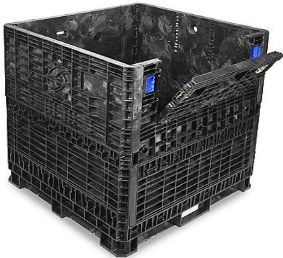
COLLAPSIBLE PLASTIC BULK BOXES 48" X 45" X 42" HIGH MIXED COLOURS DROP DOOR $ 149.00 EA / 22 AVAILABLE