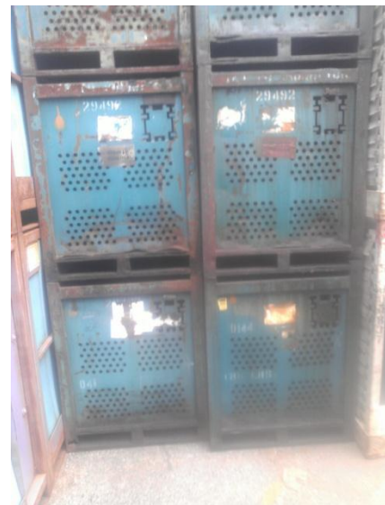
H.D. SOLID STEEL BINS 32" X 30" X 36" HIGH CORRUGATED SIDES SOLID DROP OUT FLOOR $ 159.00 EA / 100 AVAILABLE IN OHIO