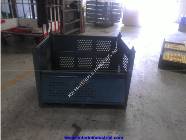
H.D. SOLID CONTAINER 48" X 36" X 34" HIGH SOLID SIDES AND FLOOR DROP GATES $195.00 EA / 50 AVAILABLE IN OHIO