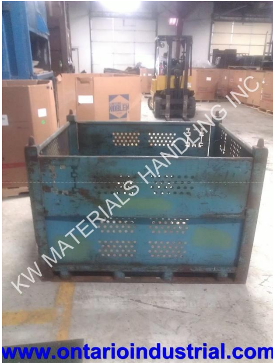
H.D. SOLID VENTED CONTAINER 54" X 44" X 37" HIGH SOLID SIDES & FLOOR 2 DROP GATES $219.00 EA / 50 AVAILABLE F.O.B. - OHIO