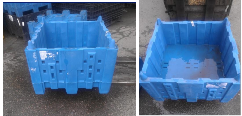
PLASTIC STACKING BINS 32" X 20" X 19" HIGH CORRUGATED SIDES 318 / TRUCKLOAD $ 69.00 EA / 600 AVAILABLE