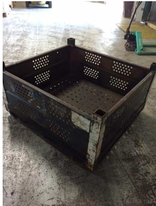
H.D. SOLID STEEL CONTAINER 48" X 45" X 25" HIGH SOLID SIDES & FLOOR NO DROP GATES $ 179.00 EA / 100 AVAILABLE F.O.B. - OHIO