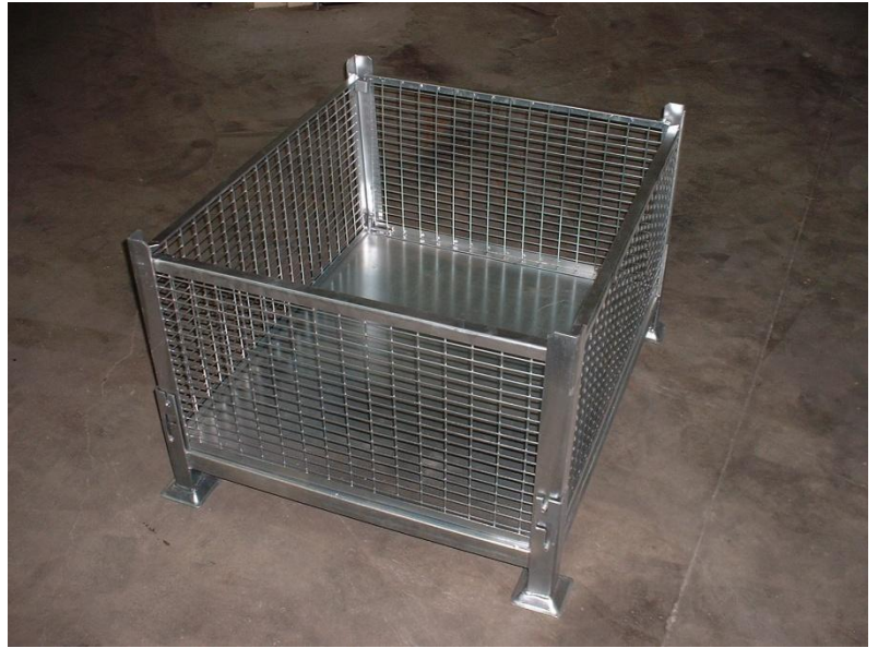
COLLAPSIBLE WIRE MESH CONTAINER 34.5" X 40.5" X 26" HIGH SOLID FLOOR / WIRE SIDES NO GATES / 4-WAY ENTRY $ 199.00 EA / 100'S AVAILABLE QUANTITY DISCOUNTS AVAILABLE