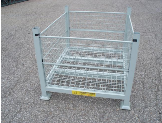
STANDARD WIRE MESH BASKETS 34.5" X 40.5" X 29" HIGH WIRE MESH SIDES & FLOOR 2 DROP GATES $99.00 EA / 100's AVAILABLE