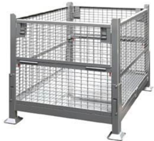
COLLAPSIBLE WIRE MESH CONTAINER 34.5" X 40.5" X 32" HIGH SOLID FLOOR / WIRE SIDES 2 DROP GATES / 4-WAY ENTRY 3200 LB. CAPACITY $ 289.00 EA / QTY. DISCOUNTS QUANTITY DISCOUNTS AVAILABLE