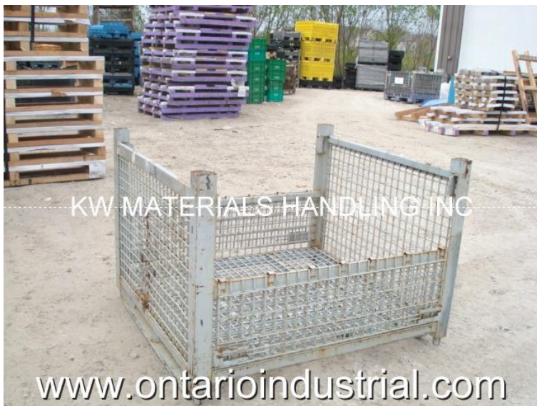
ZE13 H.D. WIRE MESH CONTAINER 53" X 48" X 38" HIGH WIRE MESH SIDES AND FLOOR DROP GATES $309.00 EA / 66 AVAILABLE IN OHIO