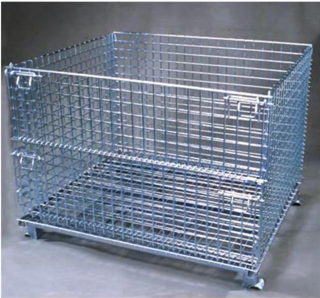
COLLAPSIBLE WIRE MESH CONTAINER 48" X 40" X 36" HIGH WIRE SIDES AND FLOOR 4-WAY ENTRY / DROP GATES HEAVY-DUTY 4000 LB. CAPACITY $ 239.00 EA / 100'S AVAILABLE QUANTITY DISCOUNTS AVAILABLE