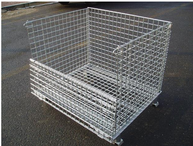
COLLAPSIBLE WIRE MESH CONTAINER 48" X 40" X 42" HIGH WIRE SIDES AND FLOOR 4-WAY ENTRY / DROP GATE HEAVY-DUTY 4000 LB. CAPACITY $ 249.00 EA / 100'S AVAILABLE QUANTITY DISCOUNTS AVAILABLE