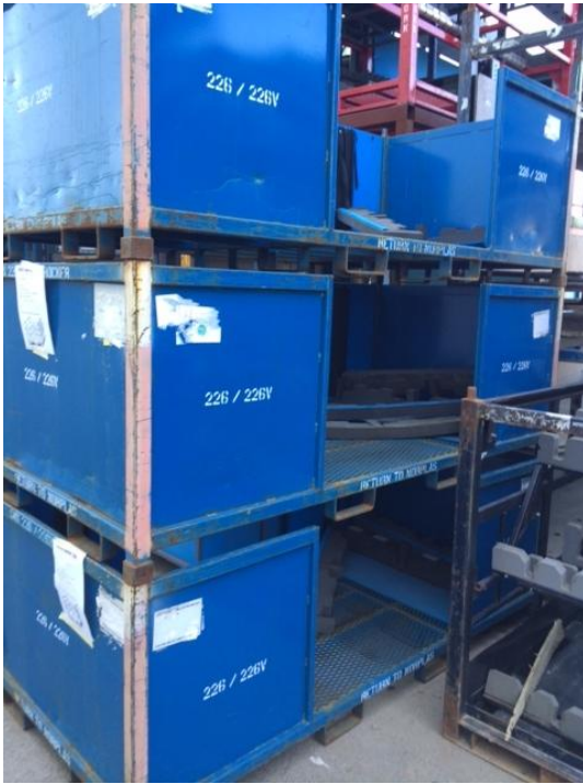
LARGE STACKING CONTAINERS 96" X 48" X 34" HIGH SOLID SIDES AND OPEN FLOOR FORK STIRRUPS PLEASE INQUIRE FOR PRICING F.O.B. - OHIO