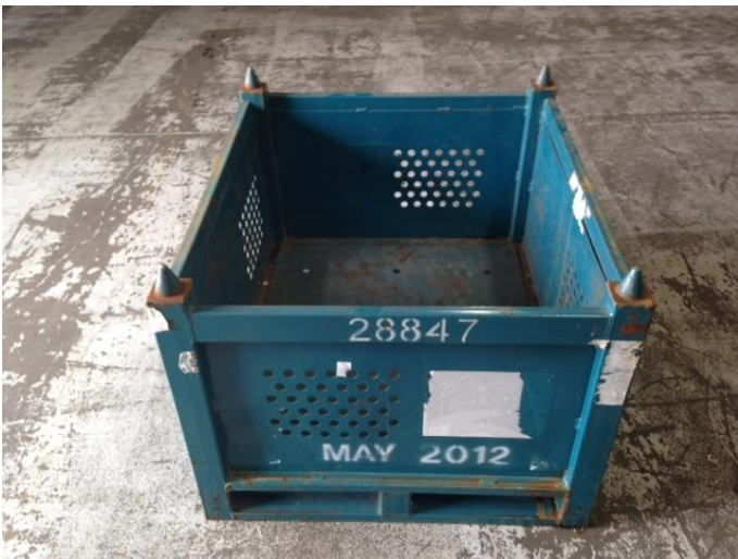
H.D. SOLID CONTAINER 36" X 32" X 24" HIGH SOLID SIDES AND FLOOR 4 WAY ENTRY / FORK STIRRUPS $140.00 EA / 50 AVAILABLE