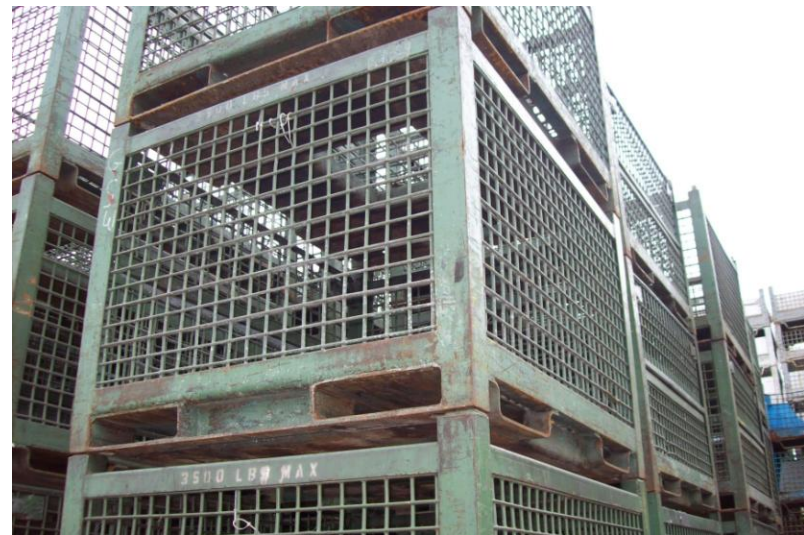
GM5131 STYLE WIRE CONTAINER 54" X 44" X 38" HIGH DROP GATE / FORK STIRRUPS PIN FEET ON TOP OF CONTAINER $ 299.00 EA / 72 AVAILABLE